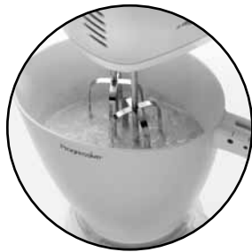
Step 2 and Step 3